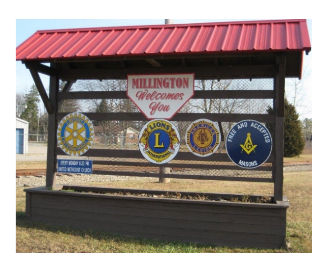
Millington - Where the Past and Present Meet